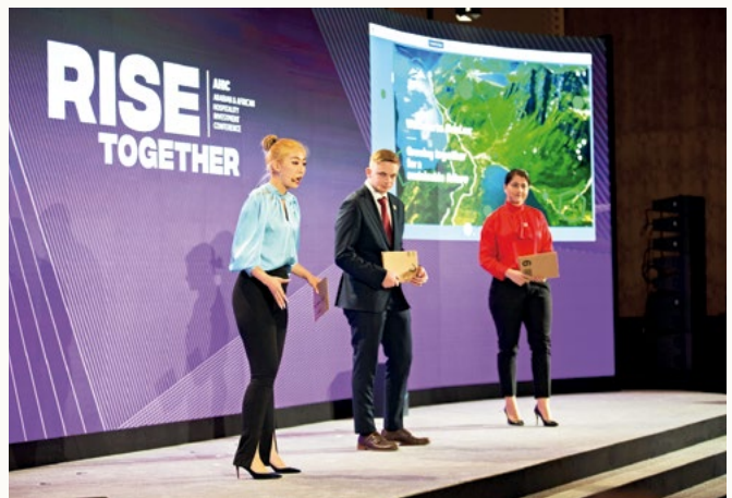
HIM students explain how improved business practices can help hospitality embrace sustainability at the Sustainable Hospitality Challenge finals in Dubai.