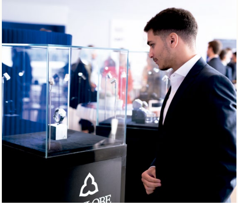
Student attends Geneva Watch Days to meet industry CEOs in Geneva, 2023