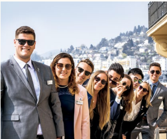
The Student Ambassador Forum (SAF) is elected BY the student body FOR the student body. Their main duty is to liaise with faculty with the aim of improving the student experience.

Twice a year, students who have demonstrated leadership potential are invited to take part in a leadership forum with representatives from all our sister schools. During this forum, students have the opportunity to learn from and connect with industry experts around the topic of leadership.