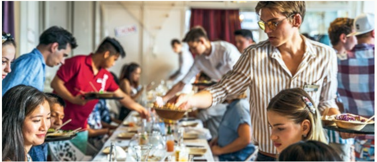
Students experience enjoyable hospitality, great food, and fun with classmates through various themed events.