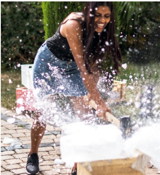
Each new term starts with a bang when students literally break the ice – by smashing an ice sculpture!