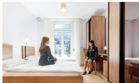
Double standard room in Hotel Europe

In the late 1800s, Montreux became a top European tourist destination and one of the first winter resorts. This little piece of paradise has attracted many artists, writers, musicians, and travelers in search of beauty, tranquility, and inspiration.