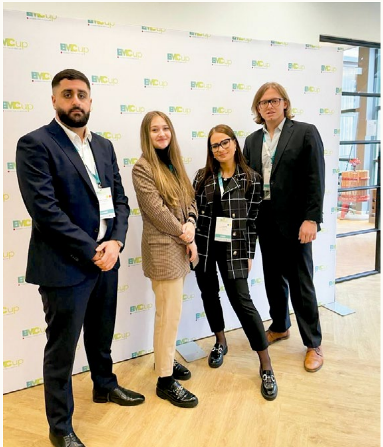
Students participate in the EMCup finals in Maastricht, 2023