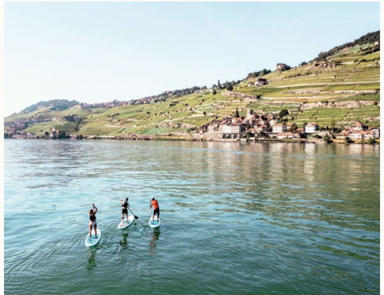
Switzerland's stunning array of mountains, valleys, lakes, and glaciers offers you a host of outdoor activities to choose from.