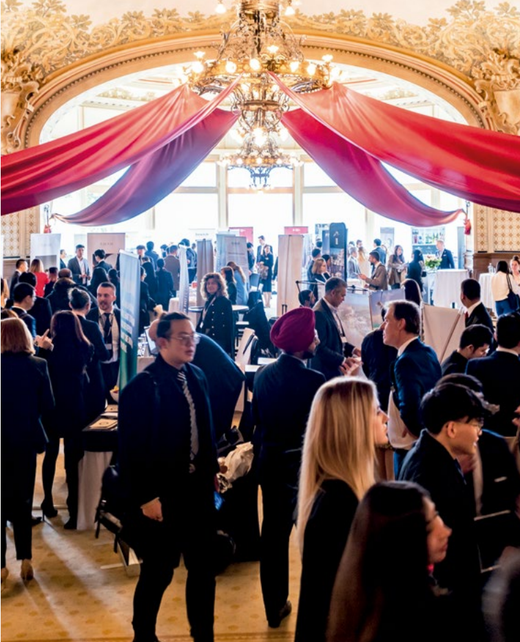
International Recruitment Forum, 2023

Our strong bonds with both industry partners and global alumni keep us on the cutting edge of insight and innovation. These relationships shape our curriculum, inspire our students to succeed, and provide access to real-world experience through a range of placements and partnerships with prestigious global brands.