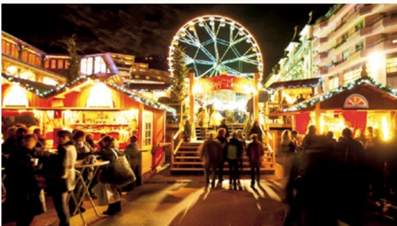
Christmas Market in Montreux