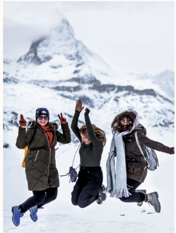
Student excursion in Zermatt, Switzerland