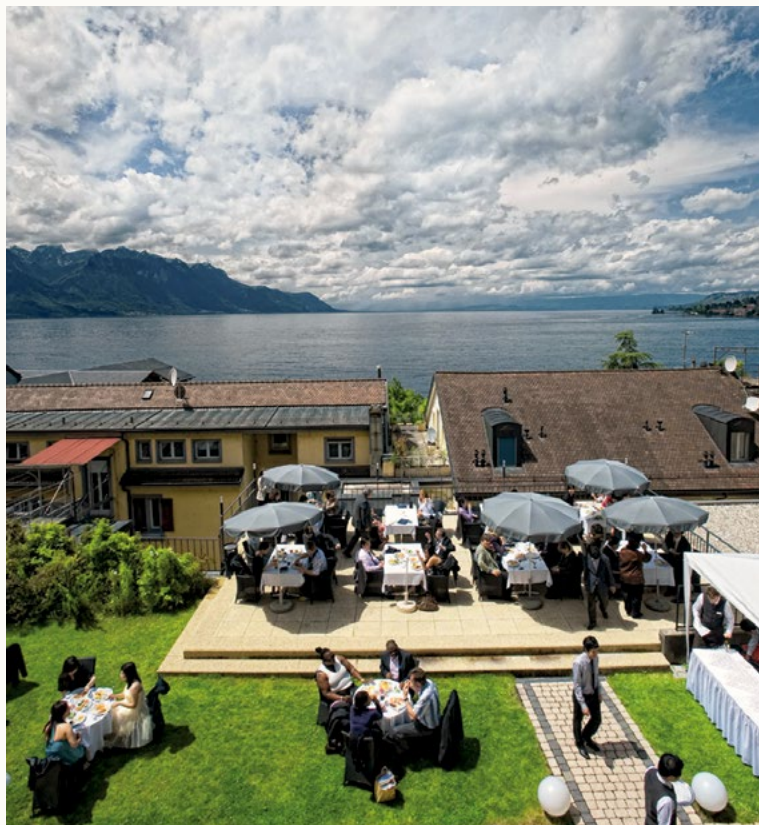
Students enjoying the terrace

Spread across five buildings, the entire community is within walking distance, creating the close-knit connections and sense of belonging that are at the heart of HIM. Each building has been renovated and equipped to provide state-of-the-art accommodation and modern learning facilities. During the summer months, you can enjoy the gardens in front of Hotel Europe or relax on the panoramic terrace and watch the sun set over the Alps.