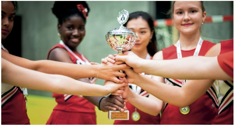
Students from across all our sister schools come together once a term for Swiss Education Group Sports Day.

Throughout the school year, we host several student events, including our quarterly Icebreaker Welcome events, our yearly Cultural Night, where students share food and performances from their home countries, and our Sports Day held twice a year.