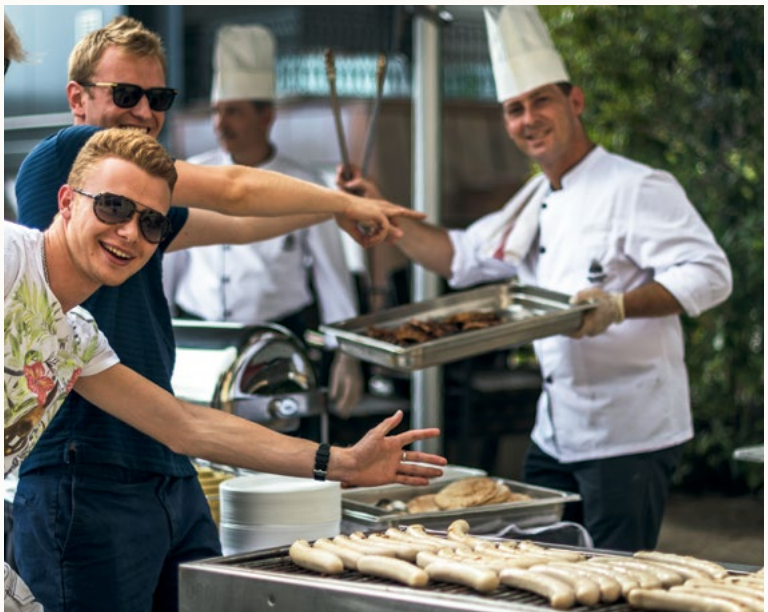
When summer comes to Switzerland, nothing can compare to a group BBQ on the stunning campus terrace.